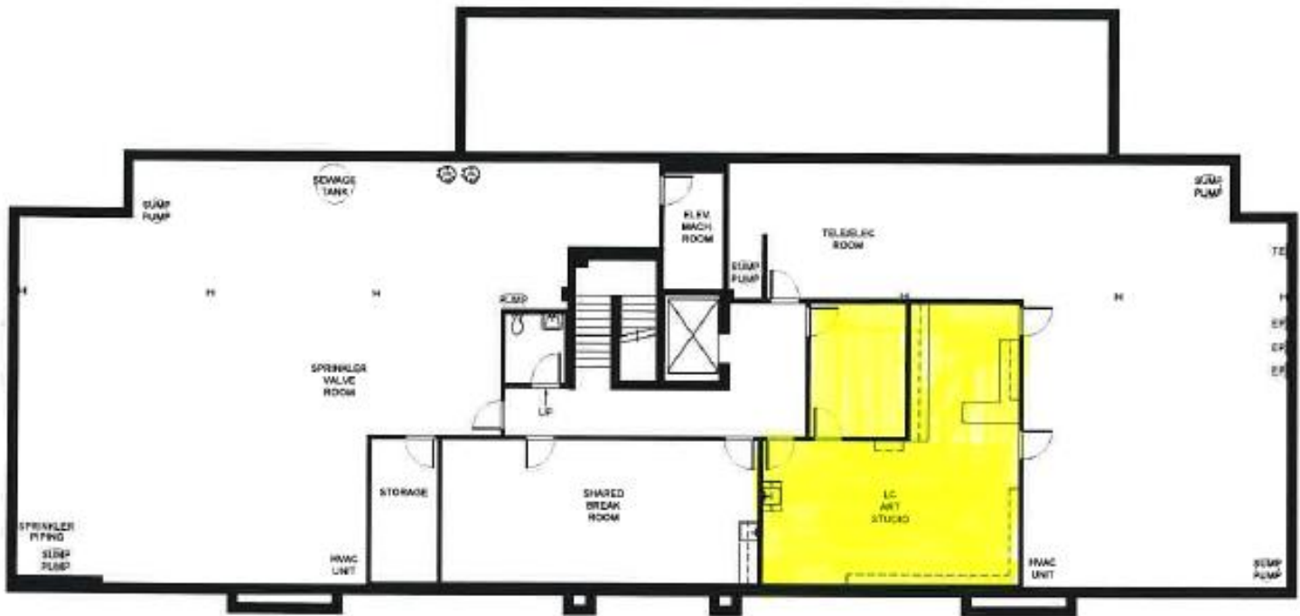
Floor Plan Scale: 1/8" = 1'-0"